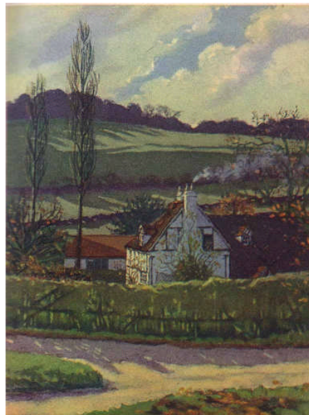
Pilgrim Cottage by Rene Noakes