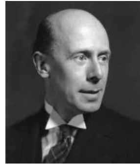
Cecil Roberts

Cecil Roberts died in Rome on 20 th December 1976, aged 84. His ashes were scattered in the garden of Pilgrim Cottage.